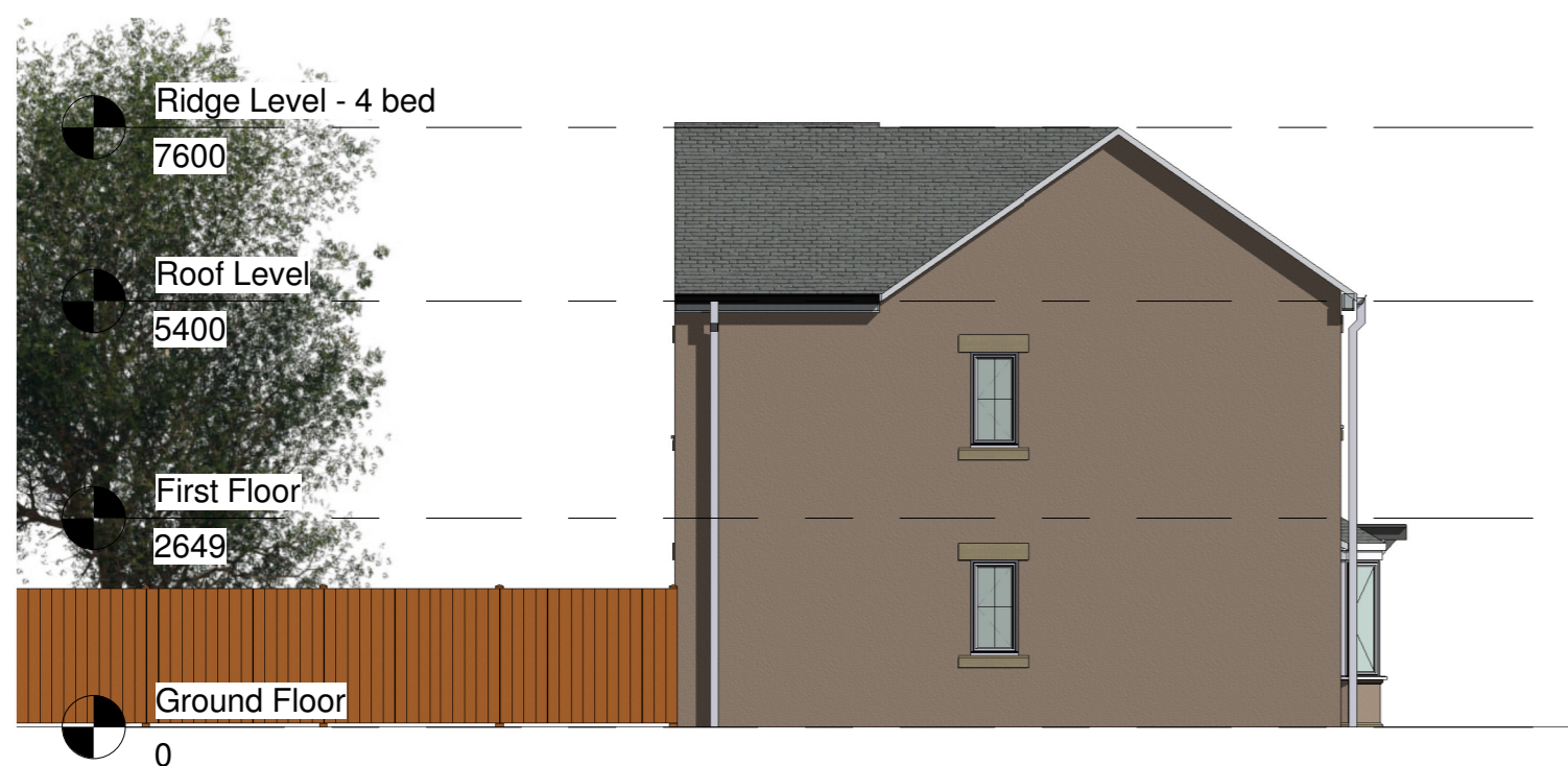
5 4 BED - WEST ELEVATION 1 : 100