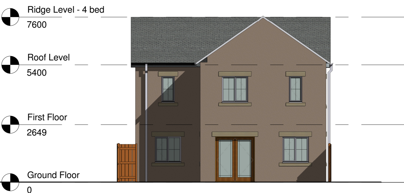
4 4 BED - NORTH ELEVATION 1 : 100