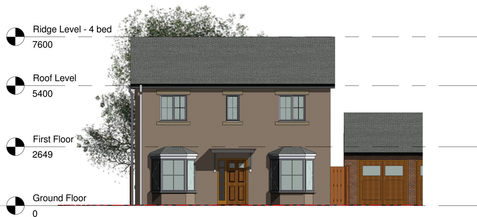
3 4 BED - SOUTH ELEVATION 1 : 100

Do not scale the drawing. Use figured dimensions in all cases. Check all dimensions on site. Report any discrepancies to BH Architecture before proceeding.